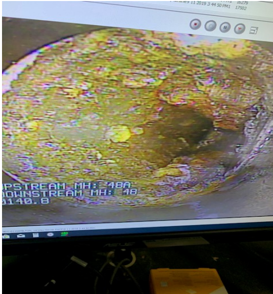
Camera inspection of a Town Sewer line, performed twenty years ago.