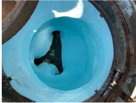
A manhole after being rehabilitated and sealed.