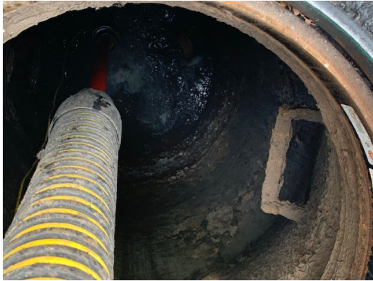
A manhole on Main Street. Note the rebar sticking out along the sides. When first constructed this rebar was placed in the middle of 4 inches of concrete, now heavily eroded.

Description: Manholes throughout town are in need of rehabilitation for the town's infrastructure. the majority of the town's manholes have not been improved in over 20 years, and have experienced considerable decay. The manholes need to go undergo extensive rehabilitation.